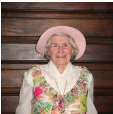
Be My Guest A Mother's Musings

I know that you live here I know that you are family But I do not own you. I have only been loaned you. You came to me From God above Because of love. I am commissioned To nurture you in the Lord To teach you God's Holy Word To quick you in the way That you should go. That I do not know.